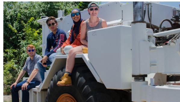
Travel funding provided, including stipend for room and board for the 10-week summer program. Underrepresented minority, women, and veteran undergraduate students are encouraged to apply.